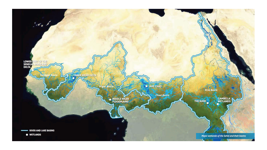
FIGURE 2: Map of major wetlands, Sahel region in Africa (Pearce 2017).

The necessity of situating ancient Kush and the Middle Nile region within the historical and cultural development of Sudanic Africa has been recommended by Nubian-studies scholars such as David Edwards when he demonstrates that Meroitic Kush's political development had more in common with later Sudanic states during the medieval period than the riverine polity of ancient Egypt.<sup>24</sup> Edwards highlights what he describes as "material power bases" shared between Meroitic Kush and Sudanic Africa, such as control of long-distance trade, nomadic pastoralism, military supremacy and the expansion of royal power through alliances and economic integration. In connecting the Middle Nile Valley with the rest of Sudanic Africa Edwards states, "we may begin to reintegrate the history of Meroe and Kush into that of Sudanic Africa."25 He suggests that Meroitic Kush is the forerunner of later Sudanic kingdoms such as Kanem-Bornu, Ghana, and Mali. Nubiologists and Egyptologists have been incessantly Egyptocentric in prioritizing ancient Nubia's relationship with Egypt, while ignoring the east-west Sudanic axis that figured so prominently in shaping Nubia's cultural development. An examination of trans-Sahelian tumuli may provide a gateway into a new field in both Nubian studies and Egyptology that resituates the Nile Valley within its interconnections to Central and West Africa. The Senegalese Africanist archaeologist Ibrahima