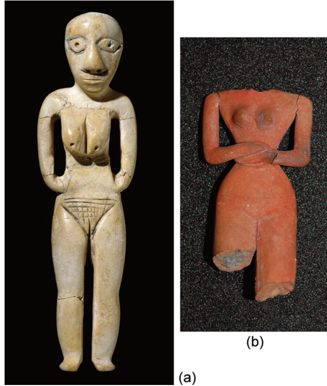
FIGURE 5: Badarian female figurines, 5th millennium BCE, el-Badari, Egypt. a: Complete standing figurine; hippopotamus ivory, 14.0 cm tall; British Museum EA59648 (British Museum n.d.b; © Trustees of the British Museum). b: Incomplete standing figurine; terracotta, head and legs lost, 9.3 cm tall; British Museum EA59679 (British Museum n.d.c; © Trustees of the British Museum).

as the raised arms of the el-Ma'mariya "bird-woman" figurines (FIG. 1a) mimic the more usual upturned configuration of bovine horns. 45 In support of the of down-turned horns hypothesis they cite the similar paradigm found on a serpentine vase, as well as instances of the popular "bull's head amulet," an ambiguous mushroom-like item that can be interpreted either as a stylized torso with inward curving arms and prominent nipples or as a bull's head with down-turned horns and forward-staring eyes (FIGS. 6a, c). 46