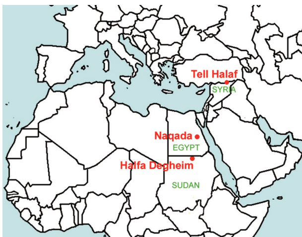
FIGURE 2: Map showing the main type-sites and/or findspots (red) mentioned in the text.

To this growing family we must make one last and crucial addition, namely a Lower Nubian A-Group figurine (4th millennium BCE) from Grave 16B in Cemetery 277 at Halfa Degheim (near Wadi Halfa), Sudan. 16 The fabric is a brownish-gray clay with sand particle inclusions. 17 It is not stated whether the figure has been baked, although a single use of the term “pottery” suggests that it has. 18 This item (excavation cat. 277/16B B:3, now Sudan National Museum cat. SNM 13729) conforms closely to the Late Halaf LH.1A template, especially in the way that the handleless arms cradle the ample breasts (FIG. 3d). 19 Naturally, there are also some differences. The seated woman’s legs are in this case extended fully before her, rather than being drawn up at the knees, and (unlike the extended legs of UC 15160 and 15153, which are partly or wholly fused) the legs of the Nubian woman are modeled as almost separate limbs, albeit with the same abstraction at the termini (i.e., no feet are shown). The modeled/incised ripples