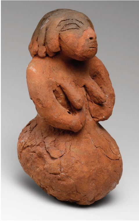
FIGURE 4: Figurine of a Seated Woman, 4th millennium BCE, Egypt; pottery (Nile clay), 11.5 cm tall; Metropolitan Museum of Art 07.228.53.