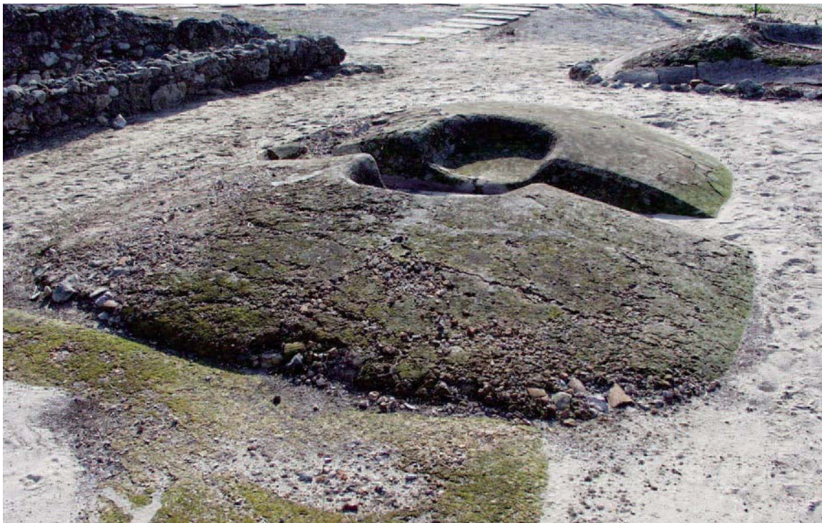
FIGURE 8: Sigma-shaped mensa tombs in the cemetery south of the Chapel of Our Lady of Tróia (photograph by Frederico Tatá Rodrigues).