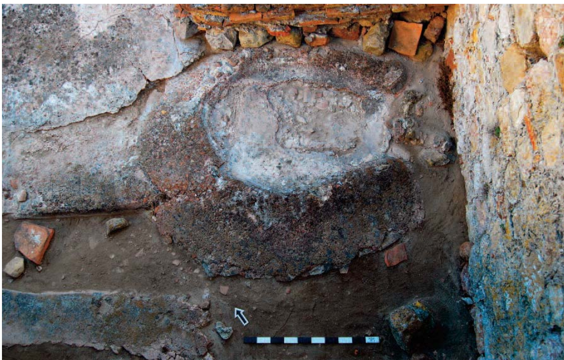
FIGURE 7: Sigma-shaped mensa tomb among other mensa tombs.