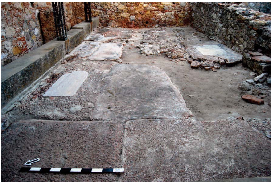
FIGURE 5: Plain mensa tombs in the compartment south of the basilica.

to the mid- or second half of the 4th century.