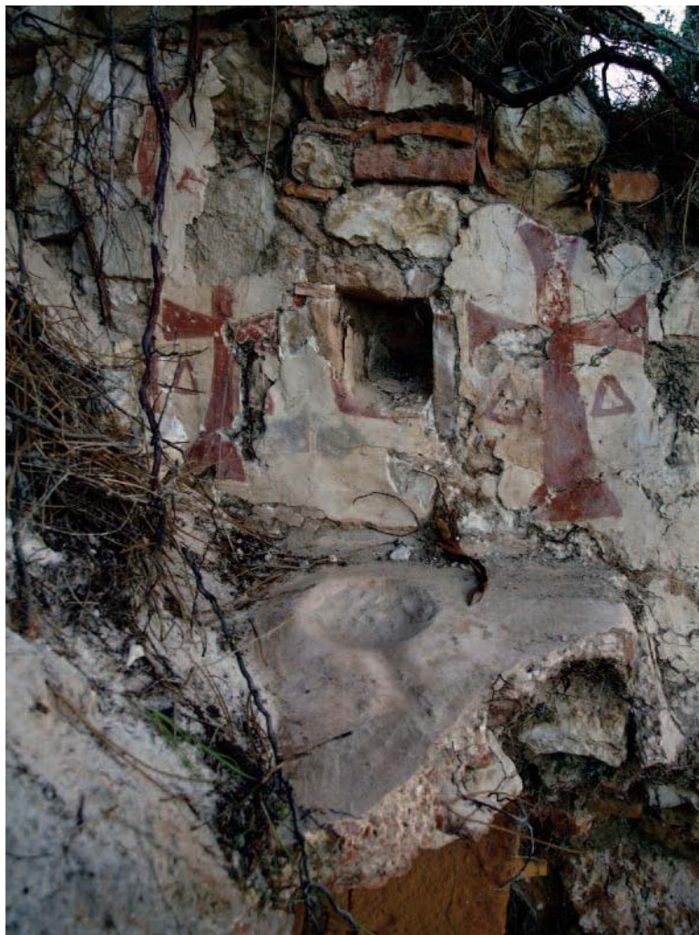
FIGURE 10: Mensa tomb with an ornamented head and concavity and canal on its covering (photograph by the author).

ANOTHER MENSA TOMB, highly damaged by the tides, was identified on the shoreline of the estuary (Fig. 3, no. 4). Its head was a fresco painting on stucco showing two dark red Latin crosses bordering a recess, a square hole in the wall, with its border in brick also painted in dark red. Above the recess, possibly a third cross, and the crosses and the recess were framed by a round arch.