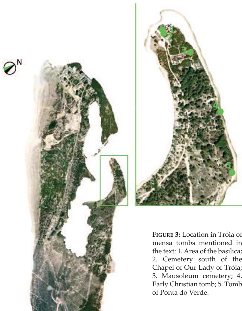
FIGURE 3: Location in Tróia of mensa tombs mentioned in the text: 1. Area of the basilica; 2. Cemetery south of the Chapel of Our Lady of Tróia; 3. Mausoleum cemetery; 4. Early Christian tomb; 5. Tomb of Ponta do Verde.

Roman African province of Mauritania Caesariensis, with an incineration. 6 Yet mensae only became common in the 4th century, especially in the same area of Tipasa (Algeria), 7 where they are frequent and continue in use until the 6th century. 8 According to P. Février, in the inscriptions of this province, the term mensa to designate the tomb is frequently used from the early 4th century onward. 9