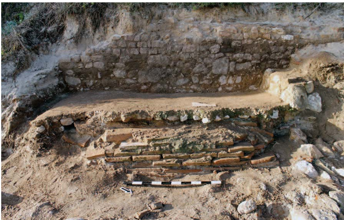
FIGURE 9: Mensa tomb of Ponta do Verde.