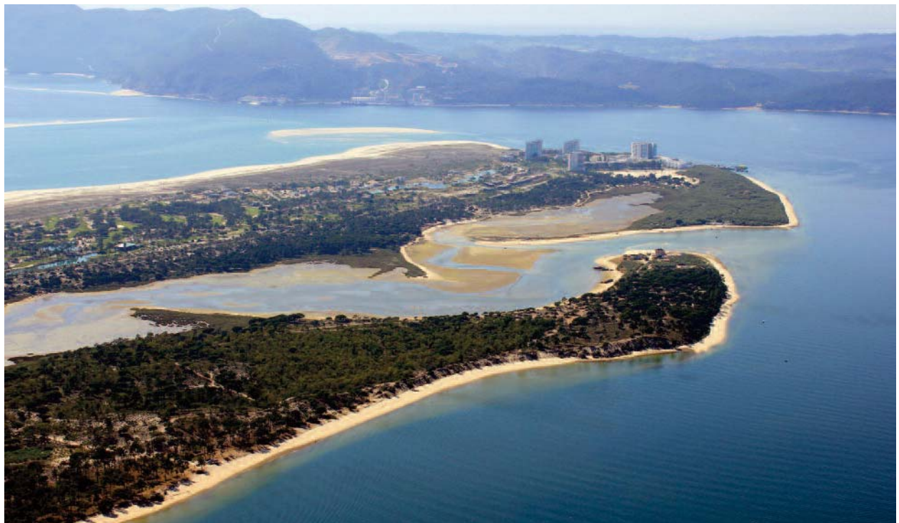
FIGURE 2: Aerial photo of the northwestern end of the peninsula of Tróia (photograph courtesy of Tróia Resort).