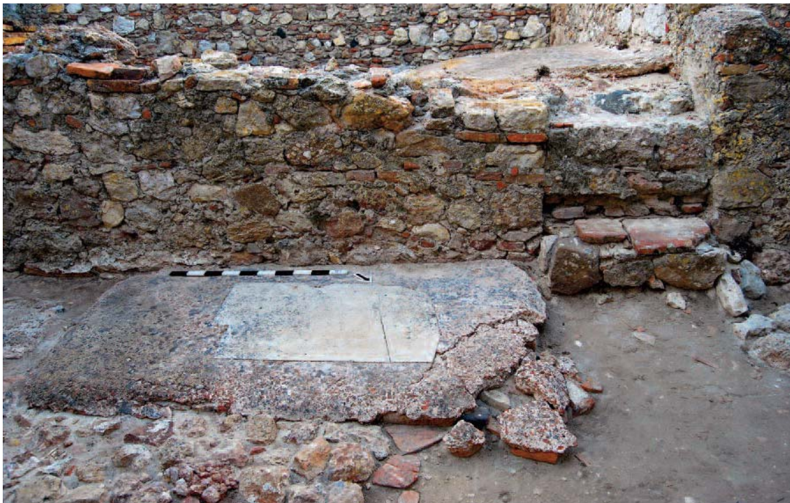
FIGURE 6: Mensa tombs at two different levels in the compartment south of the basilica.